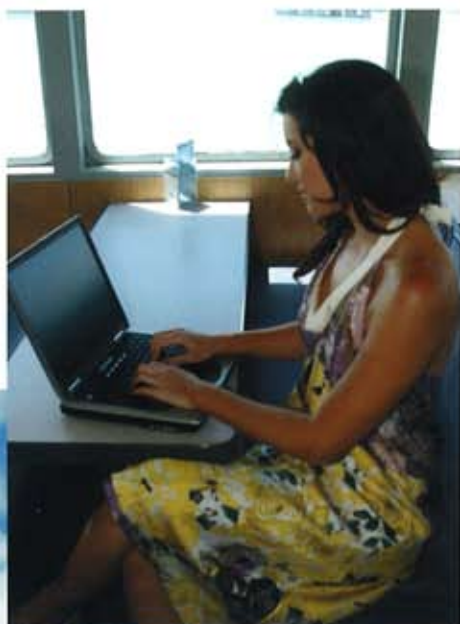
The Boat features many table counter tops for your laptop computer or snacks. Perfect for getting a head-start on work or surfing the net via free Wi-Fi.