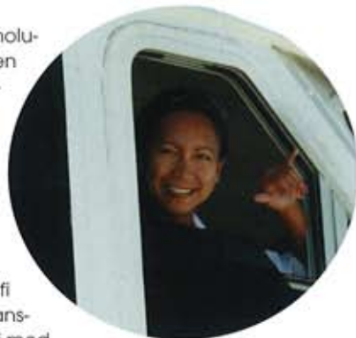
Captain Ka'ai waves from the window of the control deck

As of this writing, TheBoat offers three sailings in the morning and afternoon between Kalaheoa/Barber's Point Harbor and